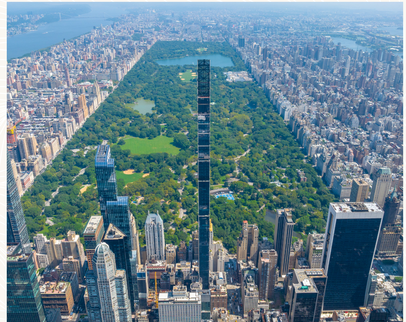
III WEST 57TH STREET • NEW YORK

A development firm of national scope, PMG has over 150 real estate transactions including over 80 residential buildings in Manhattan during its 25-year history. PMG has distinguished itself over the last decade for its development of new construction condominium developments in New York City, Miami and Chicago.