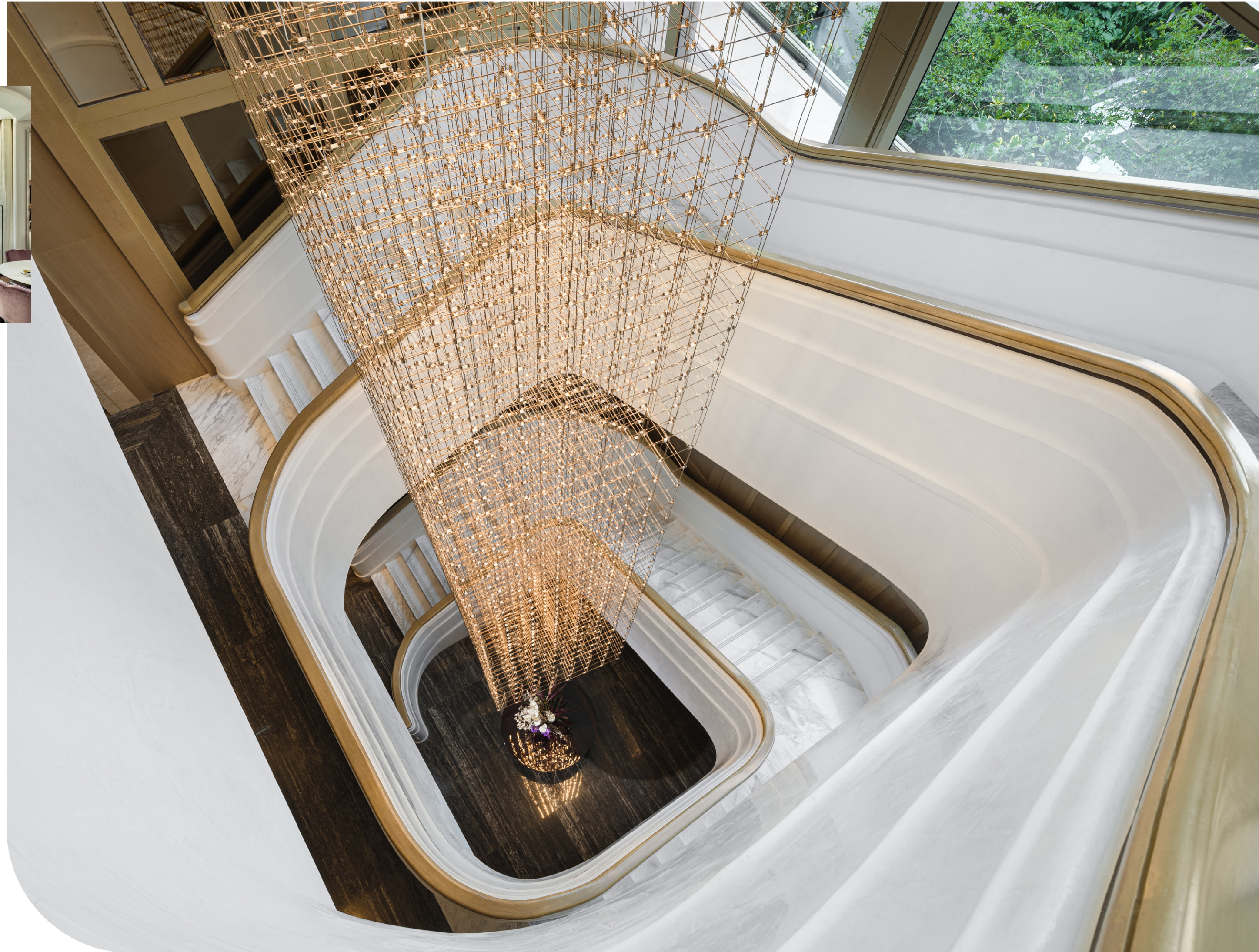
THE CAPELLA HOTEL BANGKOK

Drawing inspiration from the coastal locale, BAMO has masterfully crafted interiors that embody understated luxury and serenity. Interiors are meticulously curated with clean lines and tailored details, infused with hints of retro-inspired glamour, resulting in an ambiance of cool, classic elegance, refined comfort, and timeless sophistication.