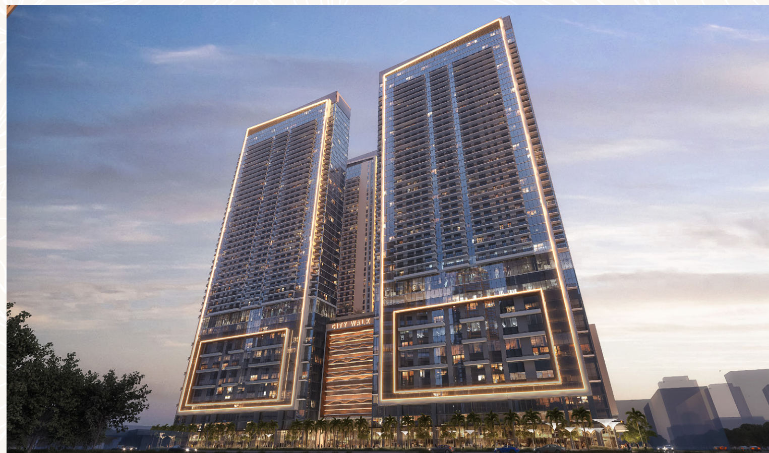
201 WEST BROWARD • FORT LAUDERDALE, FL

FSMY's deep history allows their knowledge base of codes, program, and detail to provide an invaluable level of quality with fewer challenges. FSMY's understanding of how important constant communication and the coordinated efforts of the team is, allows them to anticipate issues and add value to any Project. Their greatest satisfaction comes from providing an enjoyable and profitable experience for profitable for the entire team and establishing lasting relationships. What differentiates them is their 3D Modeling of Designs for coordination and client use as well as their in-house renderings and walkthroughs.